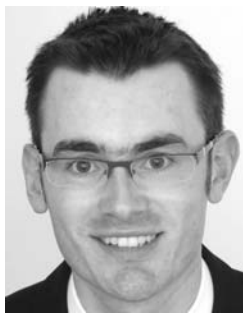
Business Director 2009

“fantastic examples of Active Citizenship at work”