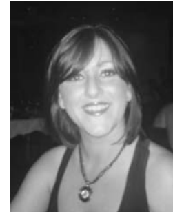
Deputy National President & International Director 2009